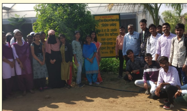
Botanical Excursion to Forest Nursery (Mahan)