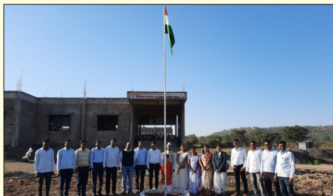
Celebration of Independence Day 2019