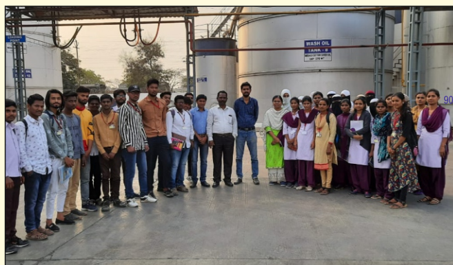
Industrial Visit at MIDC, Akola