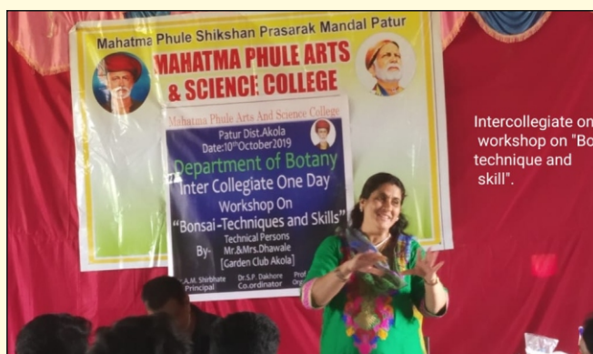
Inter College one day Workshop on Bonsai Technique and skill