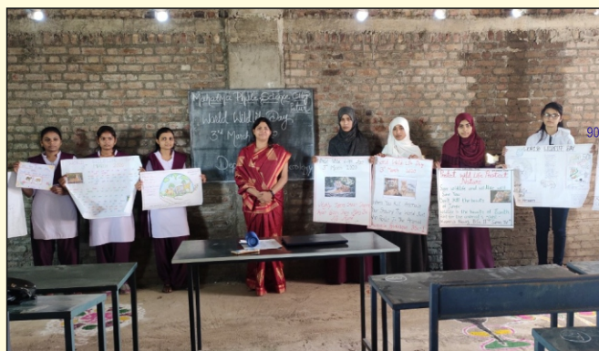
Celebration of Worldlife day by Zoology Dept.