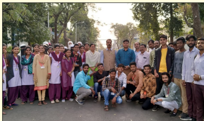
Industrial Visit at MIDC, Akola