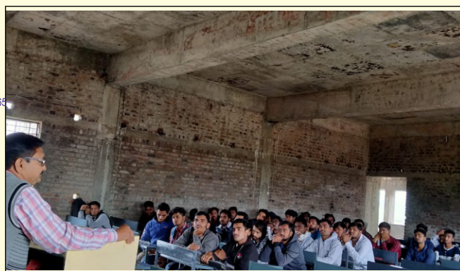
Guest Lecture Series