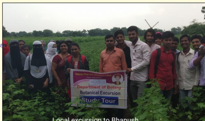
Local excursion to Bhanush Local Excursion to Bhanush