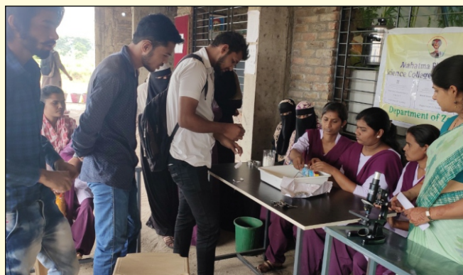
Blood Group Detection Camp organised by Zoology Dept.